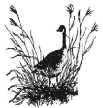
Photo Blind Finally Complete With A Bird Exhibit To Help Identify Birds...

Take Only Memories. Leave Only Footprints. Thank You Very Kindly.