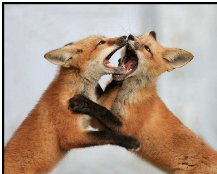
2011 People's Choice: