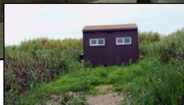
Blind as seen from the lake side...