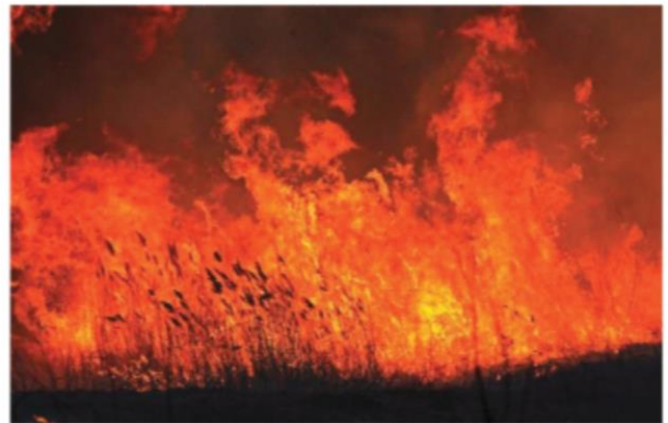
BEST IN SHOW & BEST IN COLOR

Exhibit will be at Goose Lake Prairie State Natural Area Visitors Center during open hours.