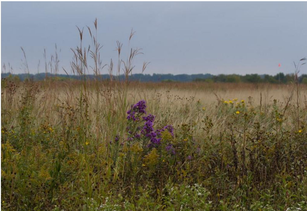
5010 N JUGTOWN ROAD, MORRIS, ILLINOIS