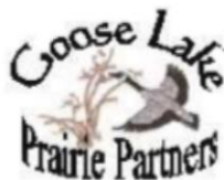
EXHIBIT: Photos will be exhibited August 13 and 14 in the Visitor's Center from 10 a.m. to 3 p.m. Display will close at 3:00 p.m. Sunday, August 14 at which time the People's Choice Award will be determined and display will be removed. Photos may be picked up on Sunday, August 14 from 4:00 to 4:30 p.m. If pickup cannot be accomplished on this date, call (815) 942-2899 to arrange pickup.

After September 1, photos remaining will become the property of GLPSNA and GL Prairie Partners.