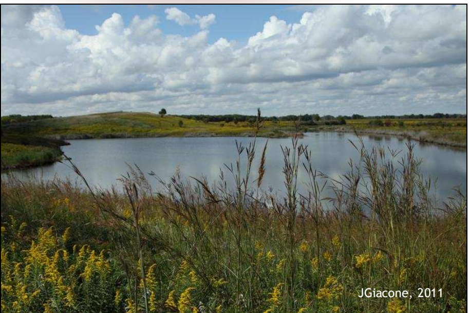
photo. The best place to view the expanse of color is on our observation deck at the visitor's center.

The Prairie Dock Sunflower plant grows upwards to 6 or 8 feet tall. The large leaf vegetation with a tall, leafless, blooming stem makes the plant very easy to identify. This particular clump was spotted near the Cragg cabin compound. It is also a feature in the flag pole garden.