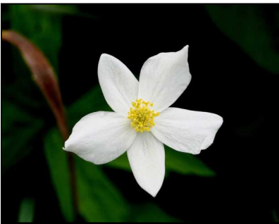
Meadow Anemone

Plants on the list marked with (A) should bloom in April.