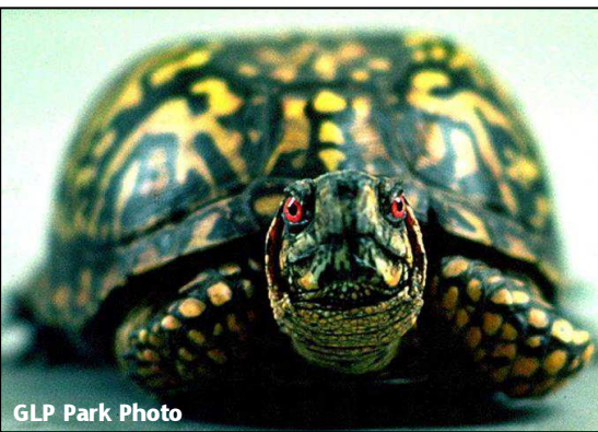
GLP Park Photo

Suddenly it dawned on me: The turtle was looking for my bog garden! A few weeks earlier, to make more room for barbecues, I had expanded my patio. In the process, I had removed the little bog I’d created earlier between the house and patio to attract butterflies with moisture-loving wildflowers.