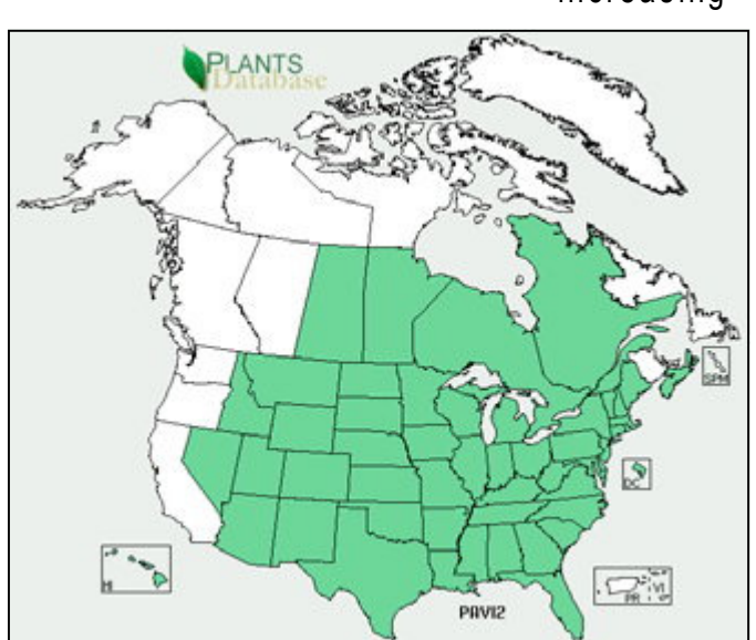
US Department of Agriculture map of native switchgrass range.

While the creation of a cleaner, more economical fuel is by no means objectionable per se, there is a lack of empirical scientific research about general switchgrass ecology, and virtually nothing is known about the potential impact of switchgrass cultivars on wild relatives. Some researchand conservation groups have expressed concern that cultivars could escape cultivation and become a weedy invader or cross with wild relatives, producing hybrids that could dilute the native gene Others believe that since forage cultivars were derived from wild ancestors and breeding cycles take years to complete, cultivars are not that far removed genetically wild counterparts. from