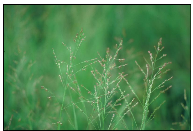
Switchgrass photo taken at Goose Lake Prairie by Art Rohr

Luckily, Goose Lake State Park has a few true remnant prairie patches, which are becoming increasingly rare and, thus, harder to find. In 2009 and 2010, with the help of prairie specialist Art Rohr, Amy visited Goose Lake Prairie and collected leaf tissue and seeds from switchgrass individuals growing in the remnant prairie patches. She will use these samples in her research, and hopefully the information Amy discovers can be used as an important jumping-off point for future ecological studies about biofuel switchgrass.