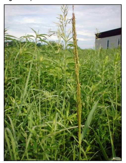
Switchgrass in it's native habitat at Goose Lake Prairie State Natural Area.

Panicum virgatum L., or switchgrass, is a warm-season perennial grass species native to much of North